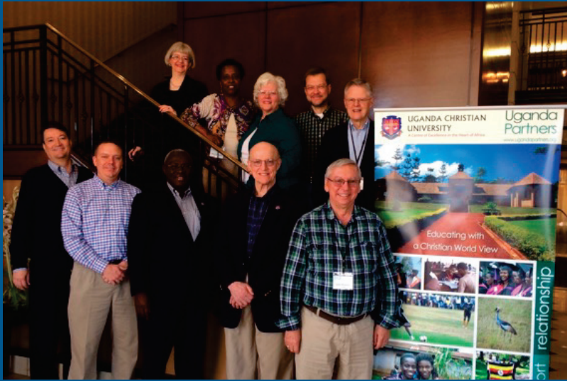
February 2015 Board Meeting