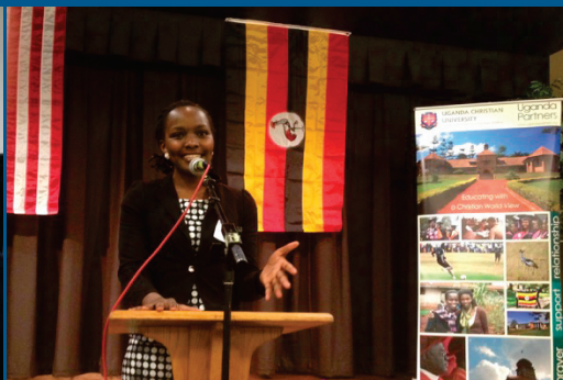
UCU Alumna speaking at an event organized by Northern Virginia trustees