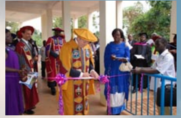
CCCU Vice President opens Kivengeri Classroom block