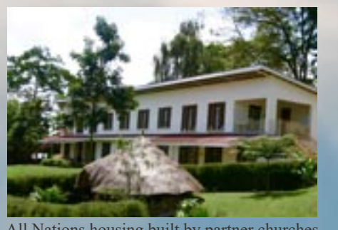
All Nations housing built by partner churches