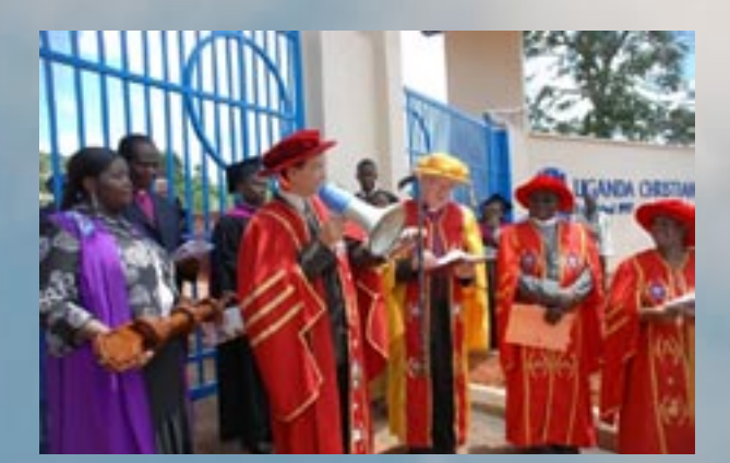
Archbishop Carey opens the main gate at UCU