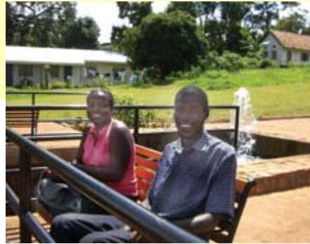
STUDENTS RELAX near the fountain on one of the pair of benches given by the Diocese of Dallas and the Diocese of Pittsburgh in 2009. (bottom right)

2009 at UCU can be summarized, as seen in these colorful pictures, as a joy-filled and productive year for the students at UCU and for those fortunate enough to visit the expanding campuses. Enrollment grew to over 7200 students in the fall of 2009 as the reputation for excellence in higher education also spread throughout the region.