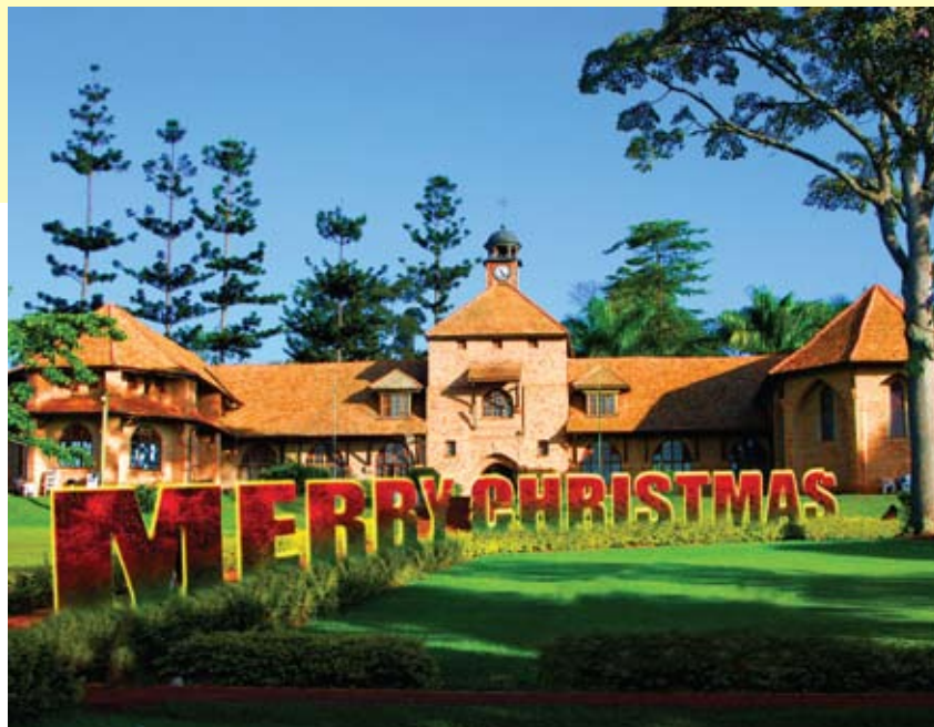
THE 2009 Uganda Christian University Christmas card.