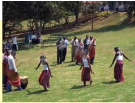
RWANDAN STUDENT DANCERS welcoming mission team at Bishop Barham College. (top right)