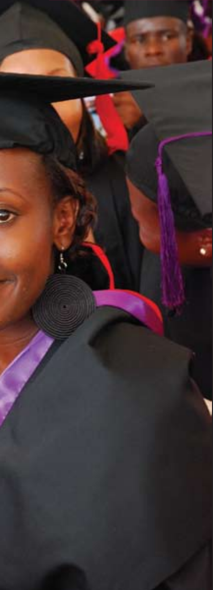
...elor of Arts in Mass Communications at ...ukono.