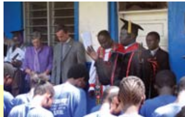
PRAYERS FOR STUDENTS at the UCU northern campus in Arua.