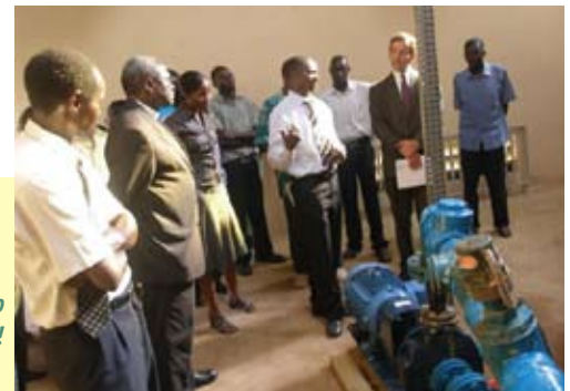
UCU WATER TECHNICIAN explains new booster pump to keep the students showering in peace!