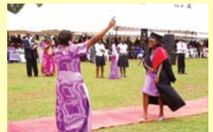
A GRADUATE'S MOTHER shouts for joy and rushes to greet her daughter.