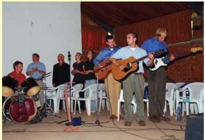
SEMESTER-ABROAD STUDENTS in Uganda Studies Program lead Community Worship on November 24, 2008.