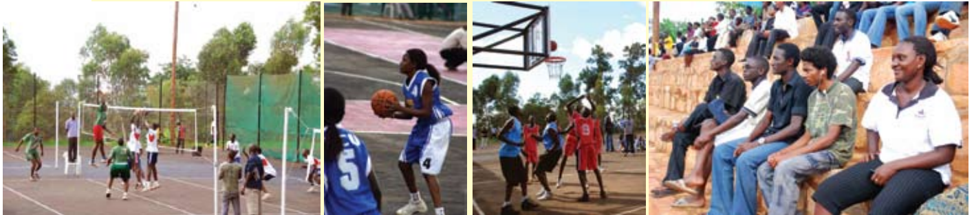
LIKE OTHER UNIVERSITIES AROUND THE GLOBE, organized and casual athletics make up a big part of campus life at UCU, for both participants and spectators.