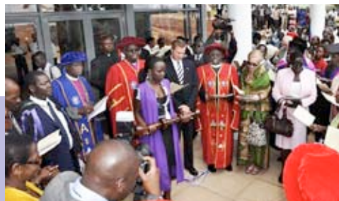
OPENING CEREMONY of the Hamu Mukasa Library.