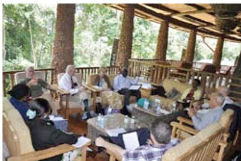
UCUP TRUSTEES meeting with UCU Officials at the Rainforest Lodge in October 2011.