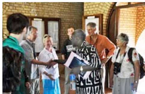
UP UP TEAM inside the Administration Building at UCU with Vice Chancellor Senyonyi.