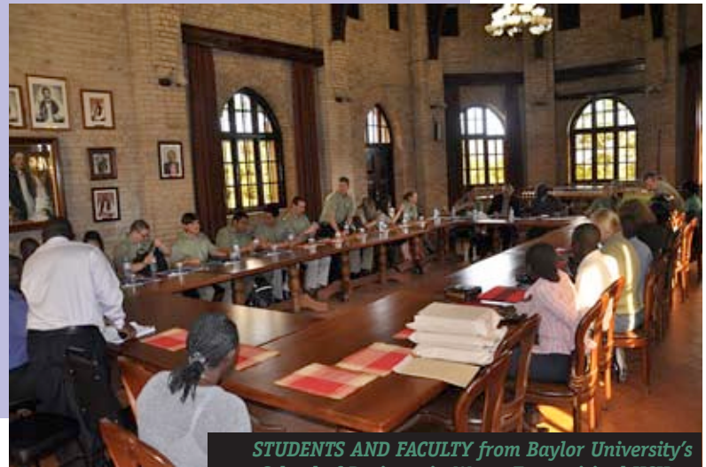
STUDENTS AND FACULTY from Baylor University's School of Business in Waco, Texas visited UCU to strengthen the partnership and discuss new trends in Business education.