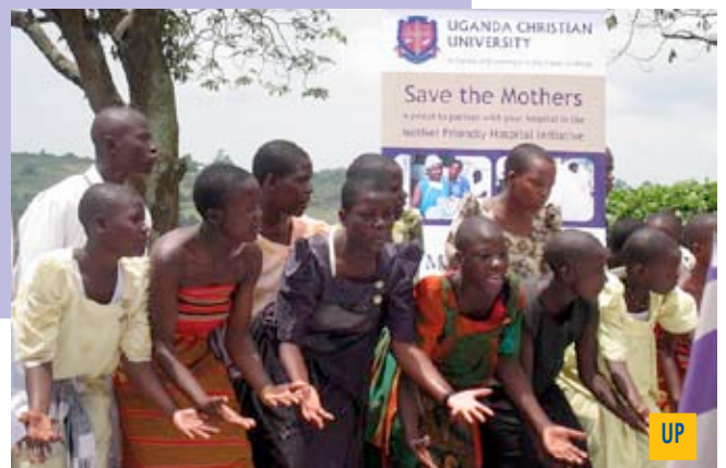
THE MOTHER FRIENDLY hospital initiative breaks ground.