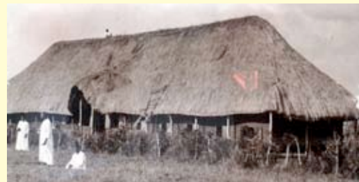
THE FIRST BUILDING at Mukono (ca 1913).

UCU is starting early to prepare for the celebration of a century of theological and higher education in Mukono. Bishop Tucker Theological College was formed in 1913 in Mukono, and produced thousands of clergy and educators over its years leading to the establishment of Uganda Christian University in 1997. UCU will host events in June and July and launch a major new project. UCU also plans to establish a museum on campus to honour the early founders of the college, the Church of Uganda and the East Africa Revival that swept through the region.