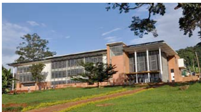
THE HAMU MUKASA LIBRARY at UCU opened in 2011.