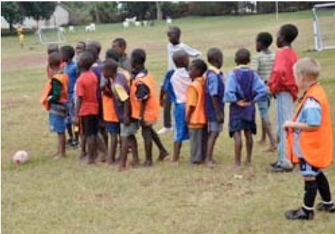
SPORTS, whether varsity basketball or a children's football (soccer) clinic, play an important roll in the life of UCU.