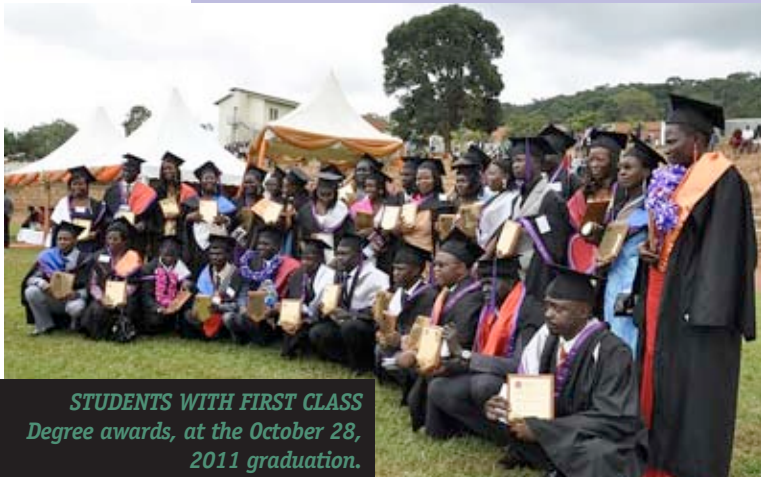
STUDENTS WITH FIRST CLASS Degree awards, at the October 28, 2011 graduation.