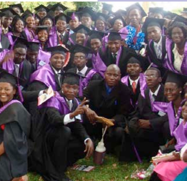
GRADUATION DAY for UCU Law Students.