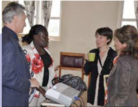
FULBRIGHT SCHOLARS working at UCU's Bishop Barham University College in Kabale, along with Fulbright scholars visiting with the US embassy in Kampala.