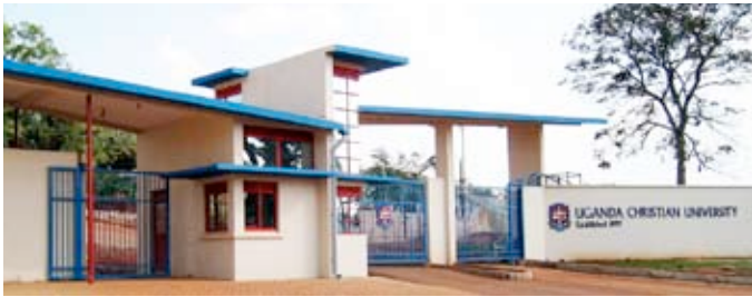
THE UCU CAMPUS' secure entrance gate provides welcome security.