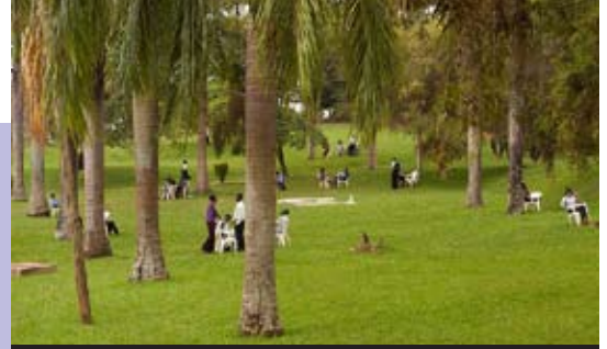
STUDENTS relaxing on the lawn in front of the Bishop Tucker main building.