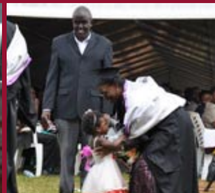
Left column from top: All smiles at graduation; UCU Sports Awards Gala; Graduation procession; looking for a bright future at Career Week